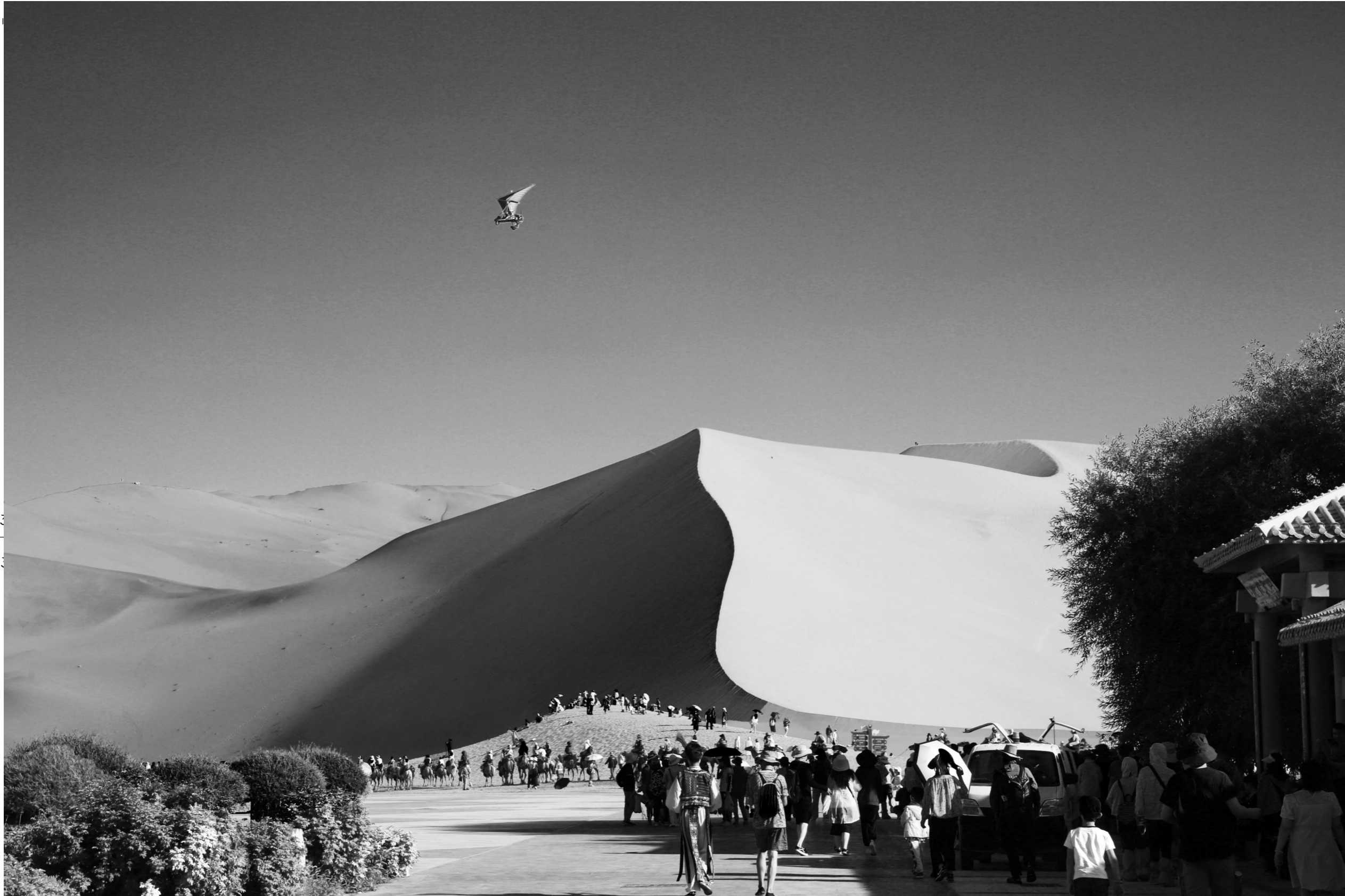
25. Before the Dune We humans are so small.